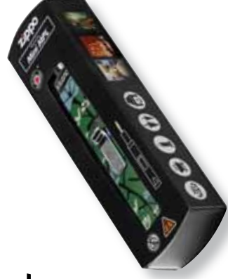
121472 NEW Black Mini in Giftbox